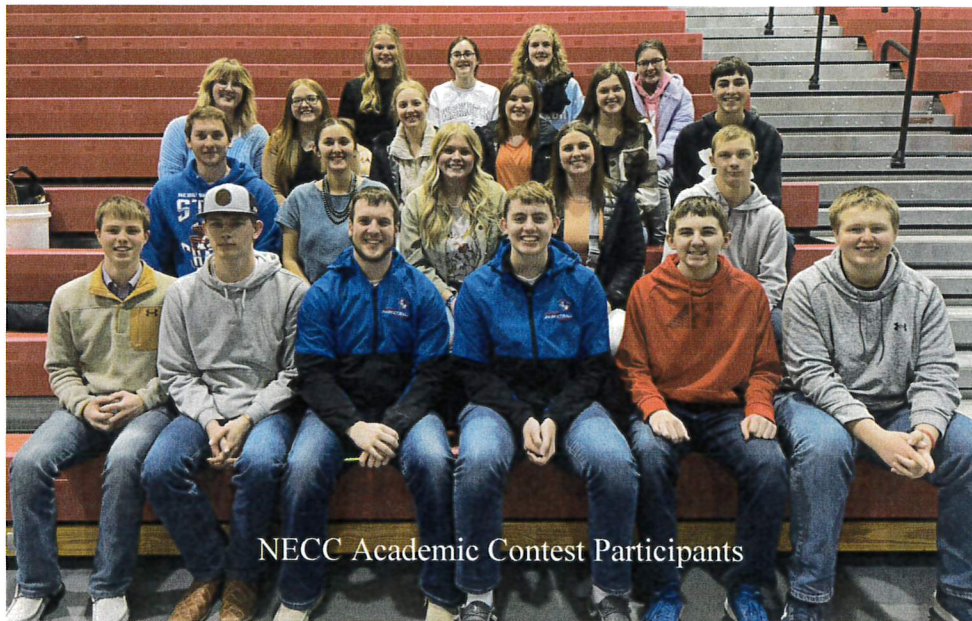
NECC Academic Contest Participants